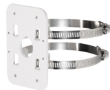
PFA152 Pole mount