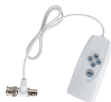
PFM820 UTC Controller