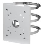
PFA150 Pole mount